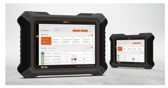
Figure 2: CAN-Bus Tester GT3

CAN FD frames and frame sequences, as well as symbolic decoding of CAN CC, CAN FD, CANopen, and SAE J1939 are possible.