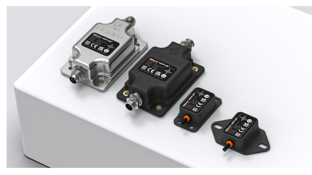
Figure 3: The Motus sensor family enables inclination measurements in mobile work environments and is available in three performance classes

The CAN-Bus Tester GT3 was presented for the first time at Agritechnica in November 2023 in Hanover (Germany), one of the world's largest trade fairs for agricultural technology, agricultural machinery, and equipment.