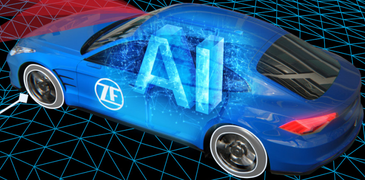
Figure 1: The AI Road Sense system can detect road conditions and driving behavior in real time, enabling predictive and adaptive chassis control

At CES 2026 in Las Vegas, ZF (Germany) presented its AI Road Sense, a CAN-based solution. It predicts road conditions and driver behavior to enhance safety and comfort.