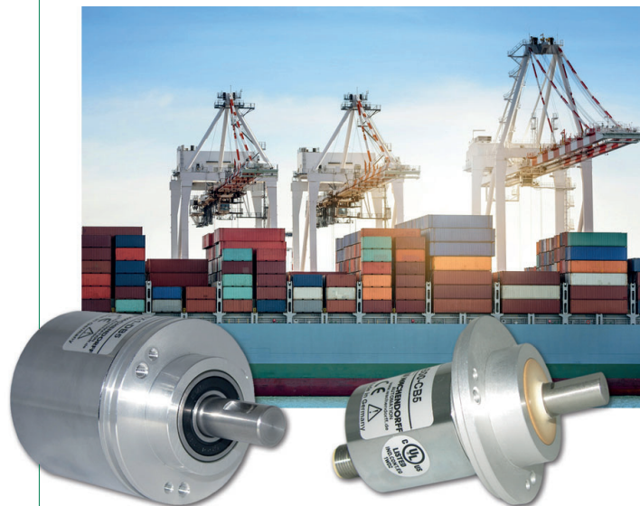
Figure 2: Encoder used in harbor cranes

Just over ten years ago, the company developed a series of absolute encoders that offer enormous advantages,