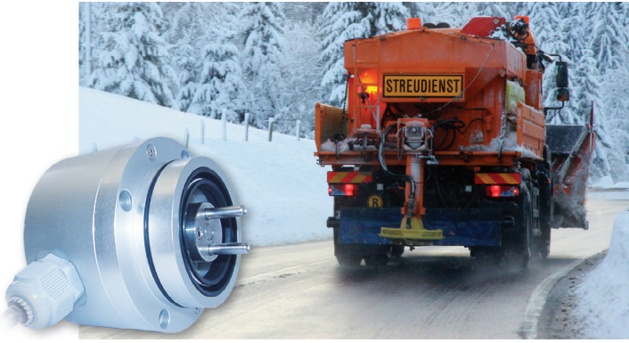
Figure 3: This encoder is suitable for optimal metering of grit

of a boom or the reach of a truck crane arm; without a cable system – directly on the winch – they can be used for length measurement. Other applications include angle measurement in wind turbines, mounted on the gear ring or directly in the cam switch, and also the feed measurement on vertical drilling machines, as well as the measurement of steering information such as angle and speed on the wheels of automated guided vehicles (AGVS) or heavy transporters. Angle measurement on cranes is a special application, as two encoders can be used here for redundant information, or the measurement can be supplemented further with a proximity switch. Whether for off-shore or on-shore applications, customers can rely on stainless steel housing that has been tested for salt water resistance.