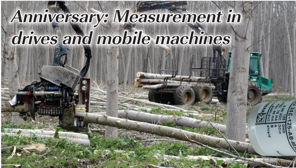
Figure 1: Speed and length measurement directly in the tool

For 40 years, Wachendorff has been offering CAN-based sensors and automation products for mobile machines and municipal vehicles. Here's a little time travel.